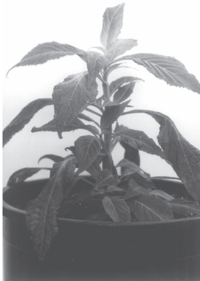
Figure 7: A healthy Salvia divinorum seedling.