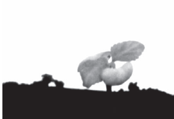
Figure 6: A Salvia divinorum seedling exhibiting stunted growth.

After sacrificing one of the seeds sent to me to be photographed with a scanning electron microscope (see FIGURES 4 and 5), I was left with 6 seeds to attempt gemination on. I decide to see if gibberellic acid-3 (GA-3) would help my success rate with germination. (See Seed Germination: Theory and Practice , second edition by NORMAN C. DENO 1 for more on the use of GA-3; this is an excellent book that I recommend to anyone who is trying to germinate difficult seeds.) On